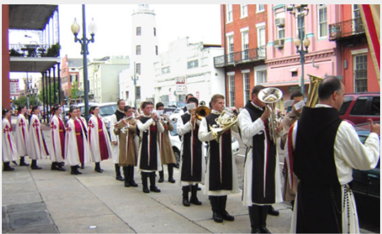
The Heralds of the Gospel follow in procession.