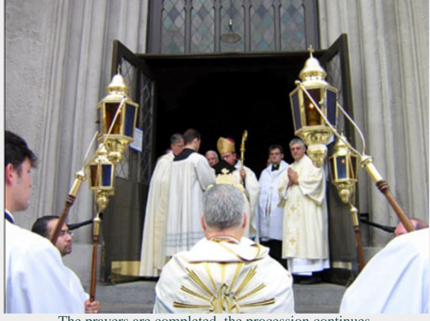
The prayers are completed, the procession continues.