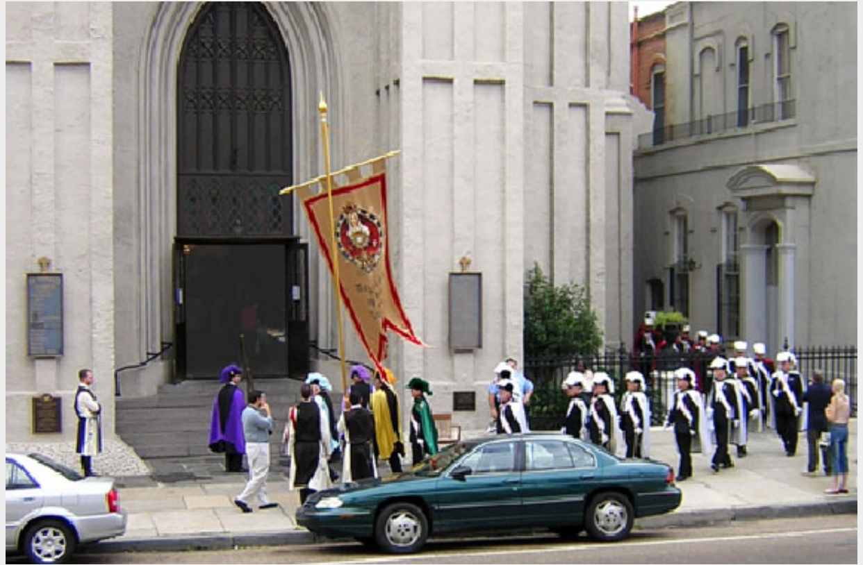
The Knights lead the opening procession into St. Patrick's.