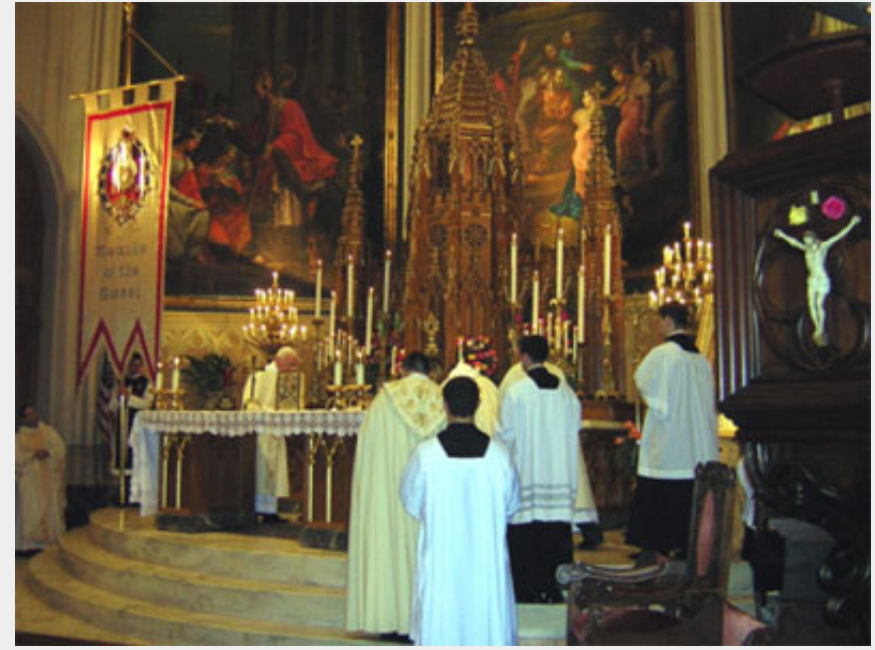
The Mass begins.